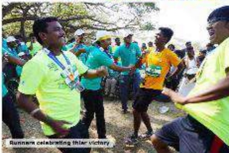
Runners celebrating their victory

• Charity Donor – Choose the amount to contribute towards charity (Rs.100, Rs. 250, Rs. 500, Rs.1000) and pay for it along with the Race Registration Charges