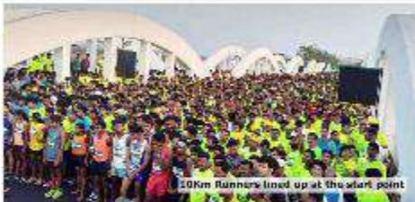
10K runners lined up at the start point